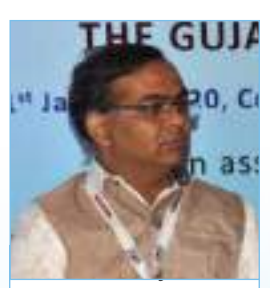
Govt Medical College Bhavnagar